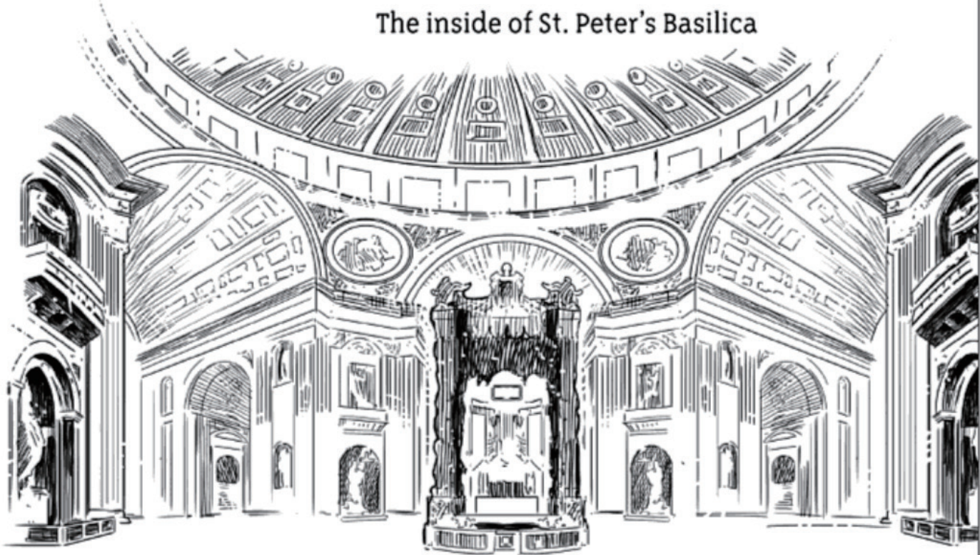
The inside of St. Peter's Basilica

artists to build and decorate magnificent cathedrals. They could lead lives of great luxury.