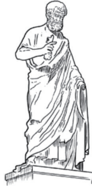
Statue of St. Peter

The pope is the leader of the Catholic Church. The first pope was Peter, one of Jesus's twelve followers. Because of his faith, Peter was killed by the Roman emperor Nero in the year 67. Many more popes were killed during the days of the Roman Empire. But in 313, the emperor Constantine recognized Christianity as a religion and became a Christian himself. After that, the papacy (the job of being pope) became a lot safer.