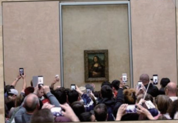
Tourists photographing the Mona Lisa in the Louvre