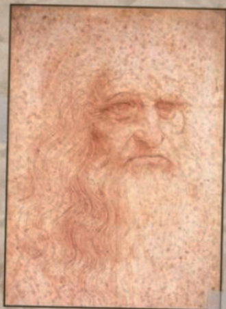
Self-portrait in chalk, age fifty