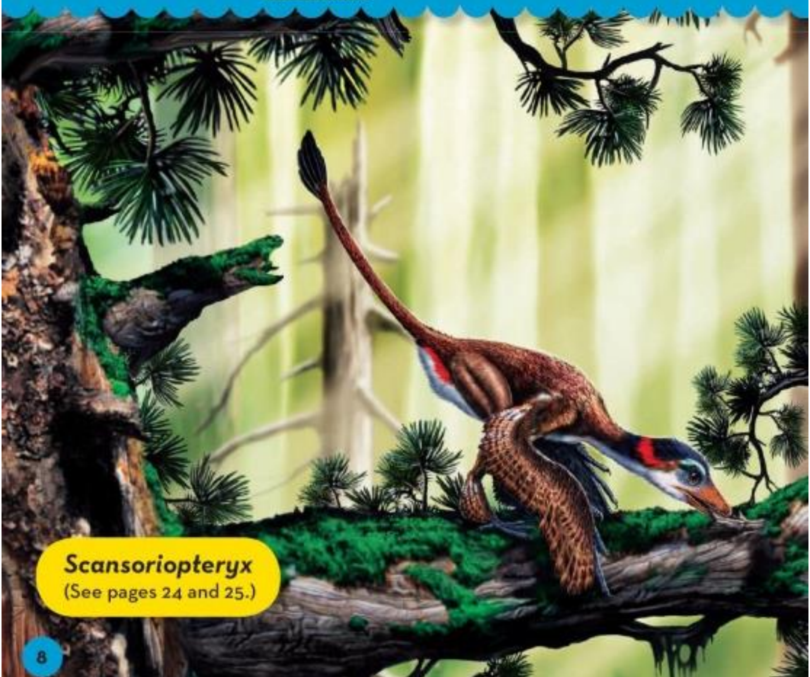
Scansoriopteryx (See pages 24 and 25.)