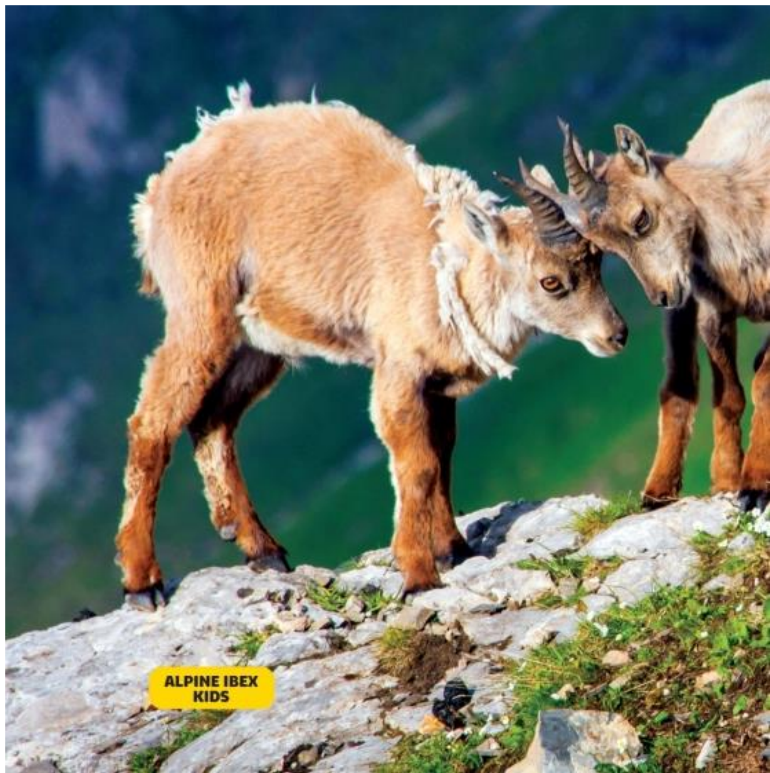
ALPINE IBEX KIDS