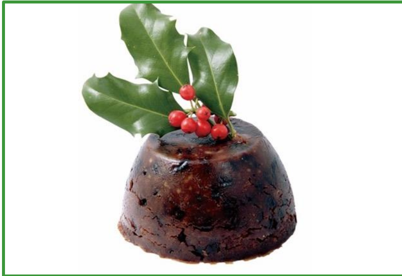
Fish and Chips