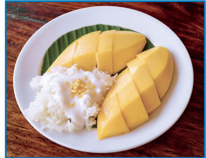
Mango Sticky Rice